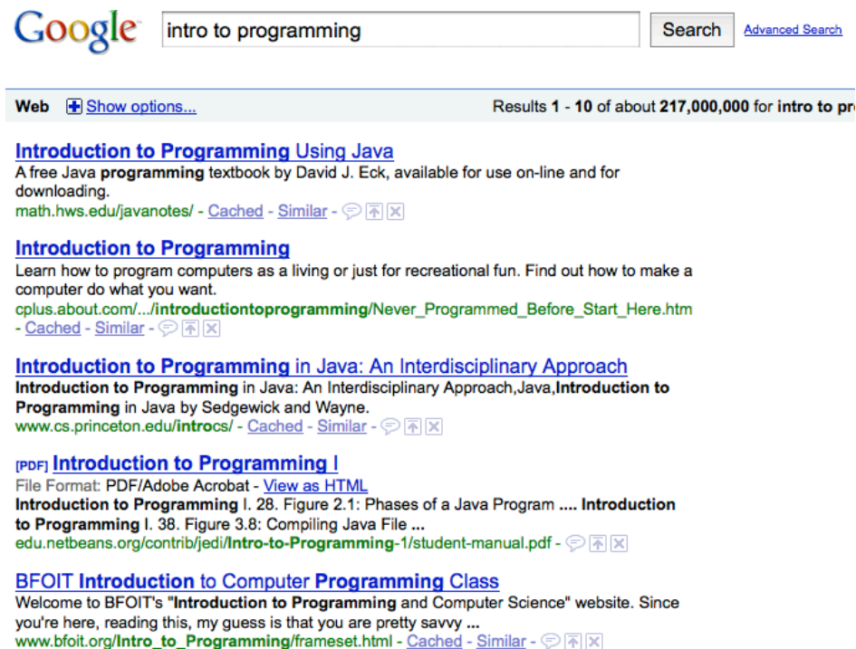
Fig. 4. Our ITLP curriculum was ranked 5 th of ~217,000,000 sites on a recent (June 2010) Google search for the phrase: “Intro to Programming”

Our SCI-FY curriculum can be broken into two categories: activities that teach science and engineering, and those that teach computing. Fortunately, the science and engineering program is quite polished, though we regularly fine-tune the projects based on student feedback. In Section 4.5 we detailed how the computing portion has changed almost every year, and in Section 8.3 we mention that it may again. Even with all the annual flux, we feel it has been effective at engaging our students, and conveying the beauty and joy of computing.