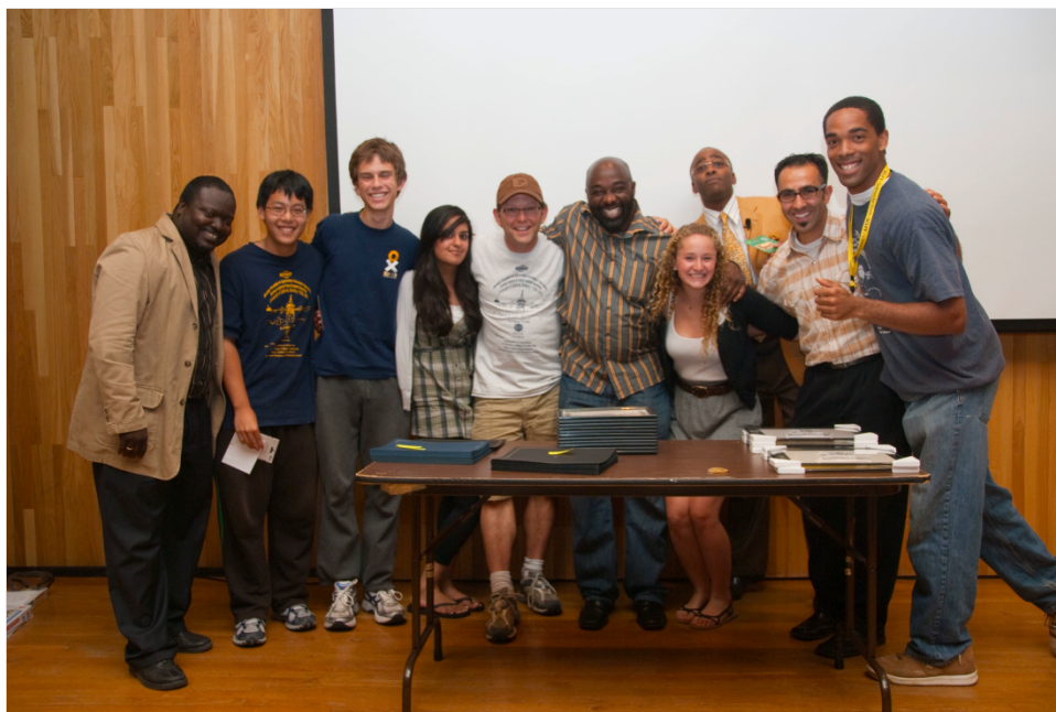
Fig. 3. Some of the world-class staff that helped run the 2009 Summer Institute.