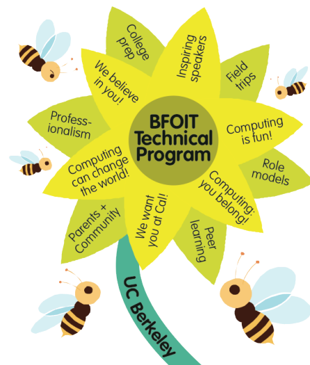
Fig. 1. An illustration to symbolize the essence of BFOIT; rooted at UC Berkeley, the BFOIT “flower” draws student “bees” to its technical program, who then are exposed to its holistic “petals” in the process. The bees bring the knowledge “pollen” back their school “hive” and tell others of this great flower, and more return.

Since our founding a decade ago, we have served 153 students, and graduated 65 seniors who have attended some of the top universities in the country, including: UC Berkeley, Massachusetts Institute of Technology, Carnegie Mellon, Harvard University, Columbia University, Brown University, University of Southern California, Boston University, Santa Clara University, UC Davis, UC Santa Cruz, University of Pittsburgh, Mt. Holyoke College and the University of Georgia. In this paper, we will discuss our programs in more detail, share testimonials from our graduates and their parents, reflect on the lessons we have learned and describe our future plans.